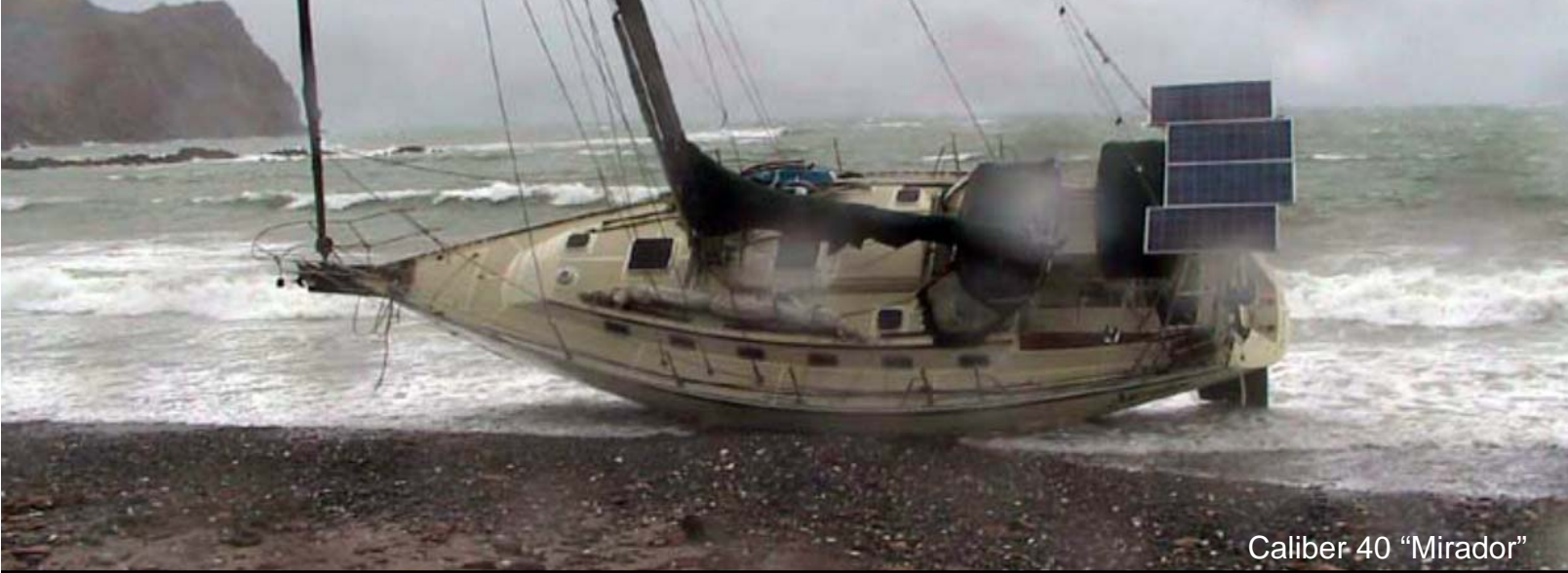
Caliber 40 "Mirador"